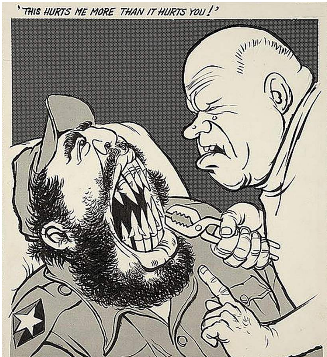
A cartoon published in an American newspaper, 30 October 1962.