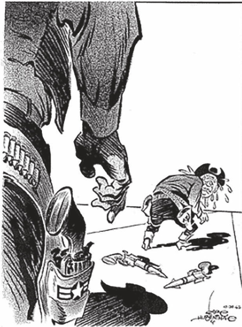
A cartoon published in an American newspaper, 29 October 1962. The figure on the right represents Khrushchev.