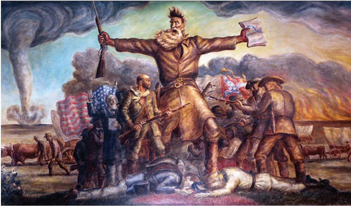
A mural entitled 'Tragic Prelude', from the late 1930s. It shows John Brown in Kansas during the 1850s. The book in his hand is the Bible. A prelude is an event that is an introduction to something more important.